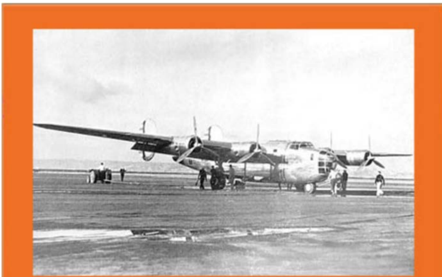
"Consolidated B-24 Liberator Bomber", Beehive Hockey Photos (2006). Retrieved 20 March 2007, from http://www.beehivehockey.com/photo_18liberator.htm