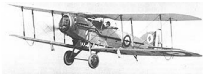
Aces and Aircraft of World War I, 2007, The Aerodrome. Bristol F.2B Fighter. Retrieved 20 March 2007, from http://www.theaerodrome.com/aircraft/gbritain/bristol_f2b.php