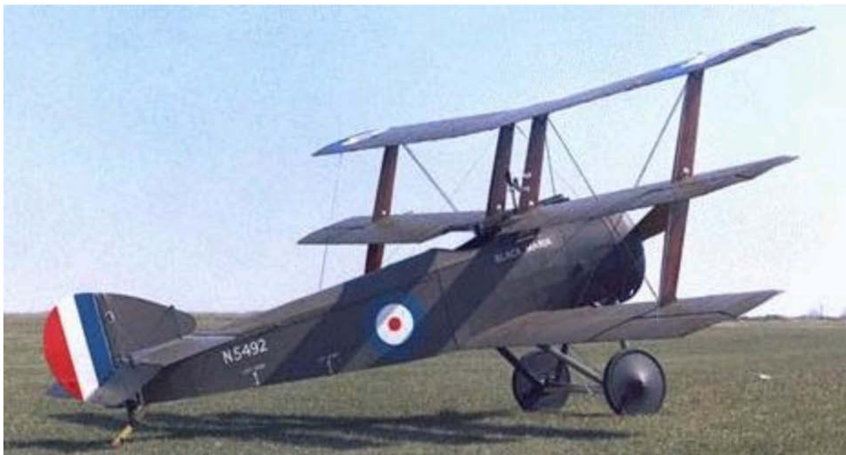
Aviation History, The Sopwith Triplane – Great Britain. (2006). The Aviation History On-Line Museum. Retrieved 20 March 2007, from http://www.aviation-history.com/sopwith/triplane.htm